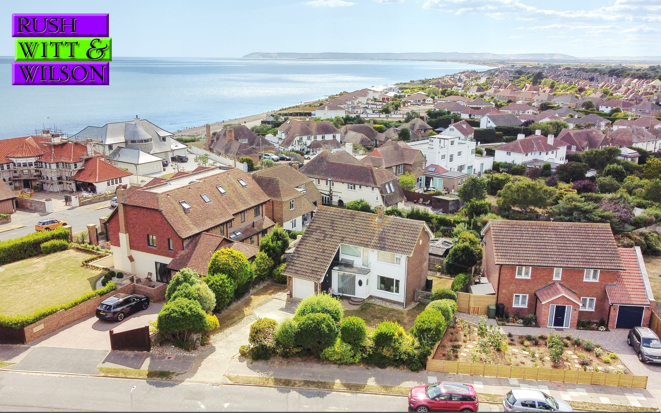
'Trimingham' 12 South Cliff Avenue, Bexhill-On-Sea, East Sussex TN39 3EB £695,000