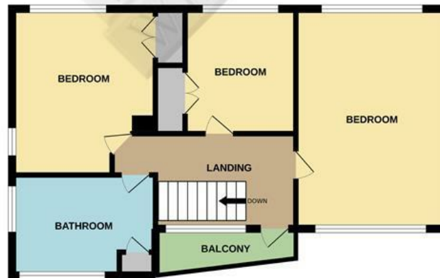
TOTAL FLOOR AREA : 1266 sq.ft. (117.6 sq.m.) approx.

Whilst every attempt has been made to ensure the accuracy of the floorplan contained here, measurements of doors, windows, rooms and any other items are approximate and no responsibility is taken for any error, omission or mis-statement. This plan is for illustrative purposes only and should be used as such by any prospective purchaser. The services, systems and appliances shown have not been tested and no guarantee as to their operability or efficiency can be given. Made with Metropix ©2022